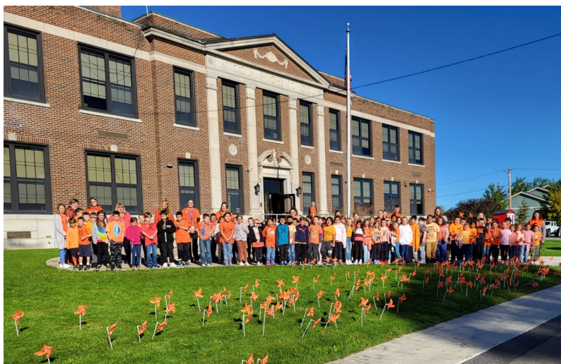
J.T. Waugh 2nd and 3rd graders gather for a group photo after placing their pinwheels in the ground.