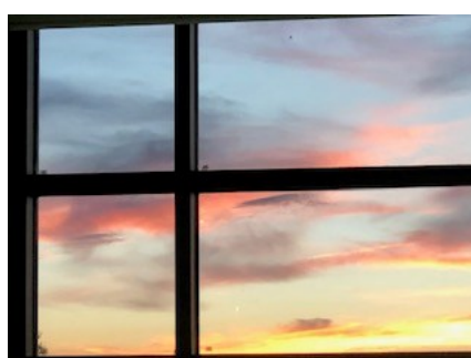
And took note of Tuesday's beautiful sunset before heading into the Board of Education meeting.