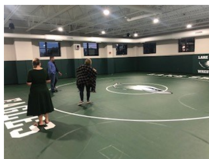
multi-purpose room ...