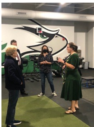
Board members also saw the new weight room ...