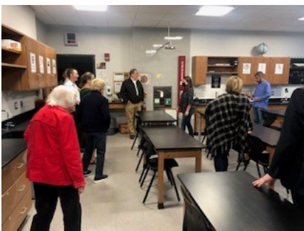
This is a newly renovated Science classroom.